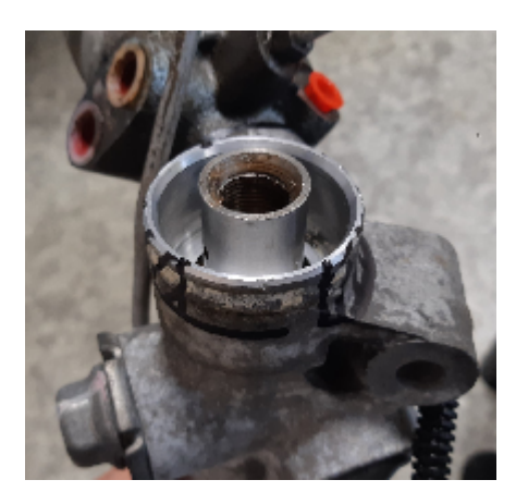
Installing the rack offset

Left and right steering rack ends have different inner diameter